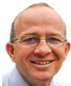
From the Headmaster

Welcome to the 200 th edition of the Lamb which continues to reflect the variety of events and activities at St John's. For those of you who were at the Arts Evening last night I am sure you would agree that all the boys excelled themselves, whether it be in Music, Drama, Art or D&T. The standard of musical performance was as high as ever and the acting in the second half was superbly executed. The interval display in the dining room showed just how committed our boys are to these subjects. I would like to congratulate everyone who was involved.