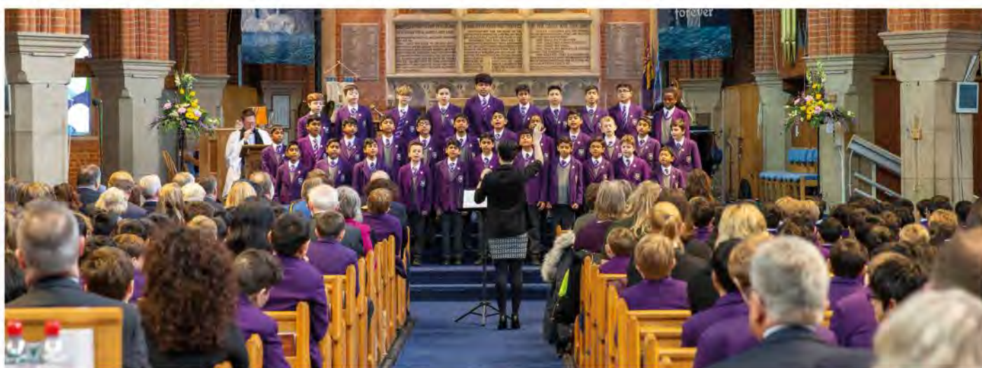
Our first Centenary event: the Thanksgiving Service at Emmanuel Church Northwood