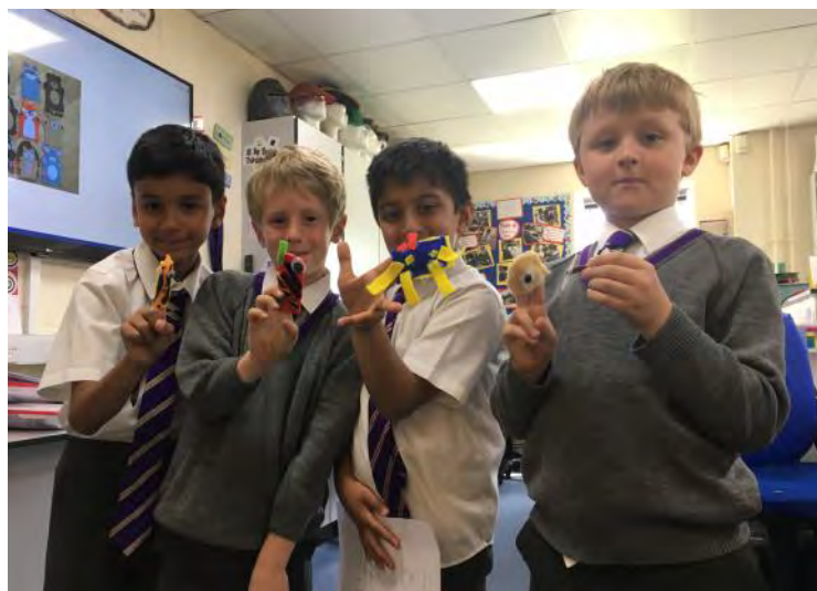
Our Year 3 boys had fun this week creating finger puppet characters in their D&T sessions.