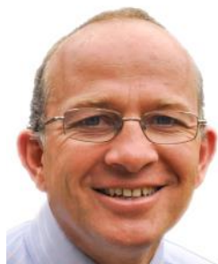
From the Headmaster

As you will see in this week's Lamb the last seven days have been packed full of interesting events many of which have coincided with the celebration of World Book Day and Science Week.