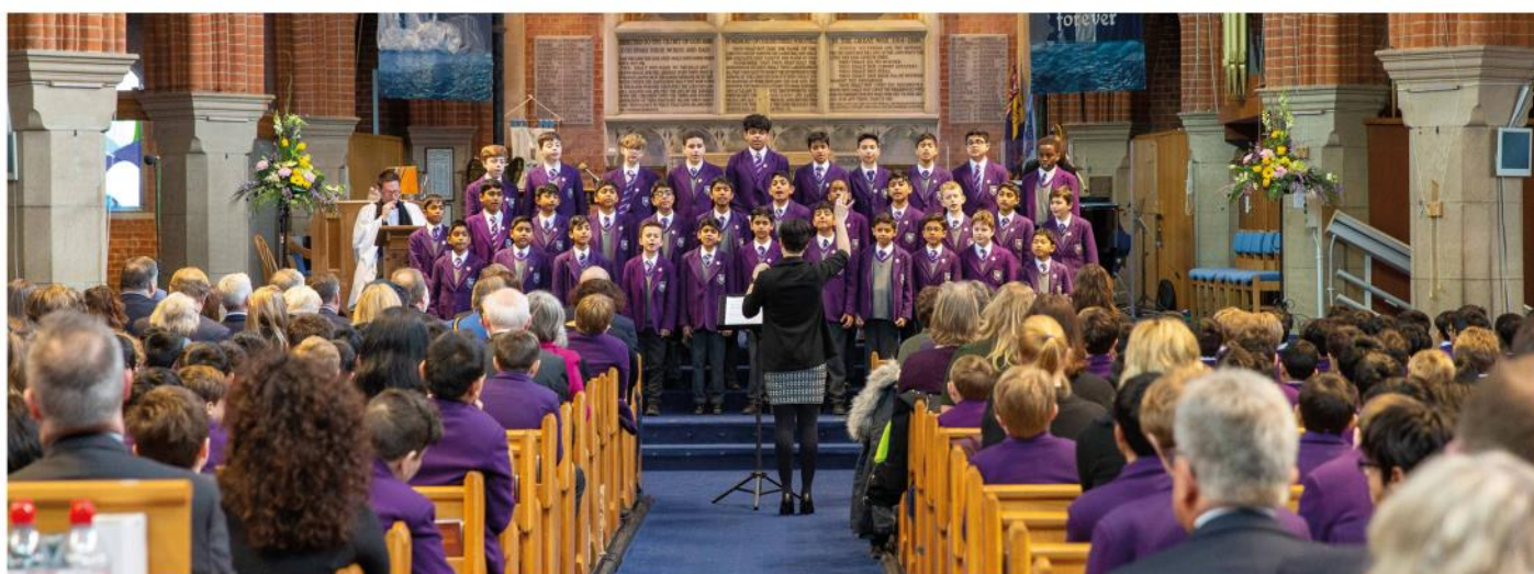
Our first Centenary event: the Thanksgiving Service at Emmanuel Church Northwood