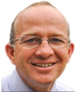
From the Headmaster

Welcome to this week's edition of the Lamb which reflects a very different kind of schooling at St John's. I was extremely pleased to welcome back the Lambs, Reception, Year 1 and Year 6 on Monday and, from conversations with staff and boys, am delighted to report that the week has gone smoothly with boys following the social distancing rules as far as is possible with small children. As you can see from the photos, boys have spent plenty of time outside as well as getting stuck into their academic work.