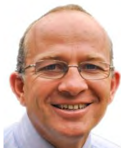
From the Headmaster

We were delighted to receive confirmation of our Year 8 results from the senior school entrance examinations including a total of twenty two scholarships. Congratulations to all of them on their achievements. They have now started their post exam curriculum which includes the Business Enterprise course.