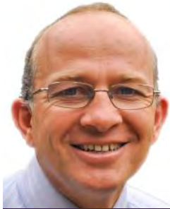
From the Headmaster

Whilst Year 8 have been focussing on their senior school transfer exams the boys from Years 5, 6 and 7 have completed their own assessments. Having spoken to many of them they have found the papers fairly challenging but felt they have benefitted from this important experience especially the Year 7 boys who took their papers in an exam hall for the first time.